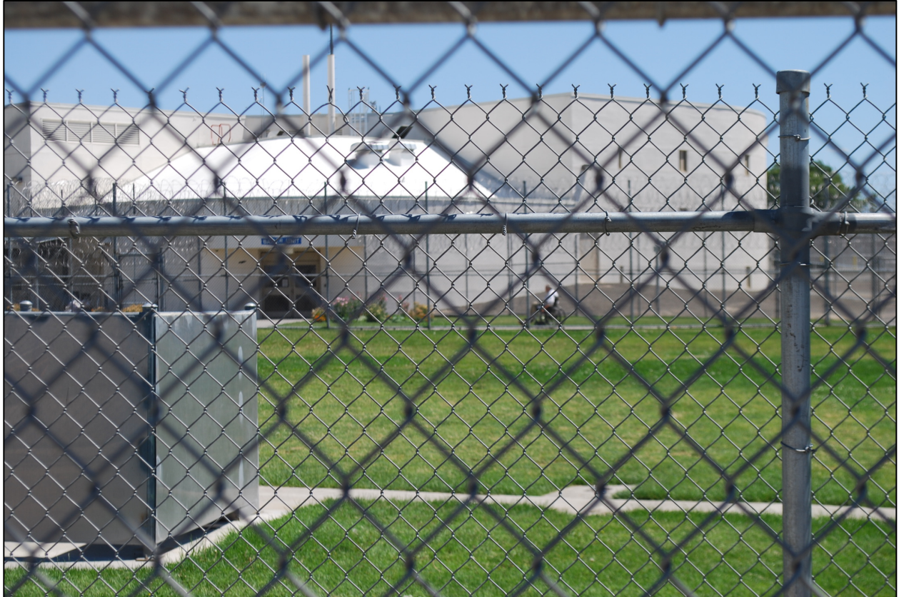
Photo 4 An inmate in a wheelchair through a fence.

Notably, the protections of the ADA extend not just to ensuring that the physical structure of a prison is accessible, such as ramps, wide hallways, and appropriate grab bars in bathrooms, but also to the programming within the prison. Therefore, if an inmate has a disability that limits their mobility such that they cannot access the dining area, under the ADA that inmate is being improperly excluded from participation in an activity and the prison is obligated to provide either modifications or accommodations that would allow the inmate to access the dining area along with the rest of the population. Similarly, an inmate with a cognitive disability who cannot participate in educational or treatment-related programming in prison due to his or her inability to process written information would be protected by the ADA and the prison would be responsible for providing that inmate with a reasonable accommodation to ensure programmatic access.